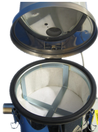
Anti-static polyester fabric filter with compressed air cleaning