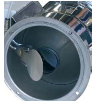
Self-sealing discharge flap without gasket