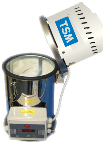
Hinged Lid for easy access